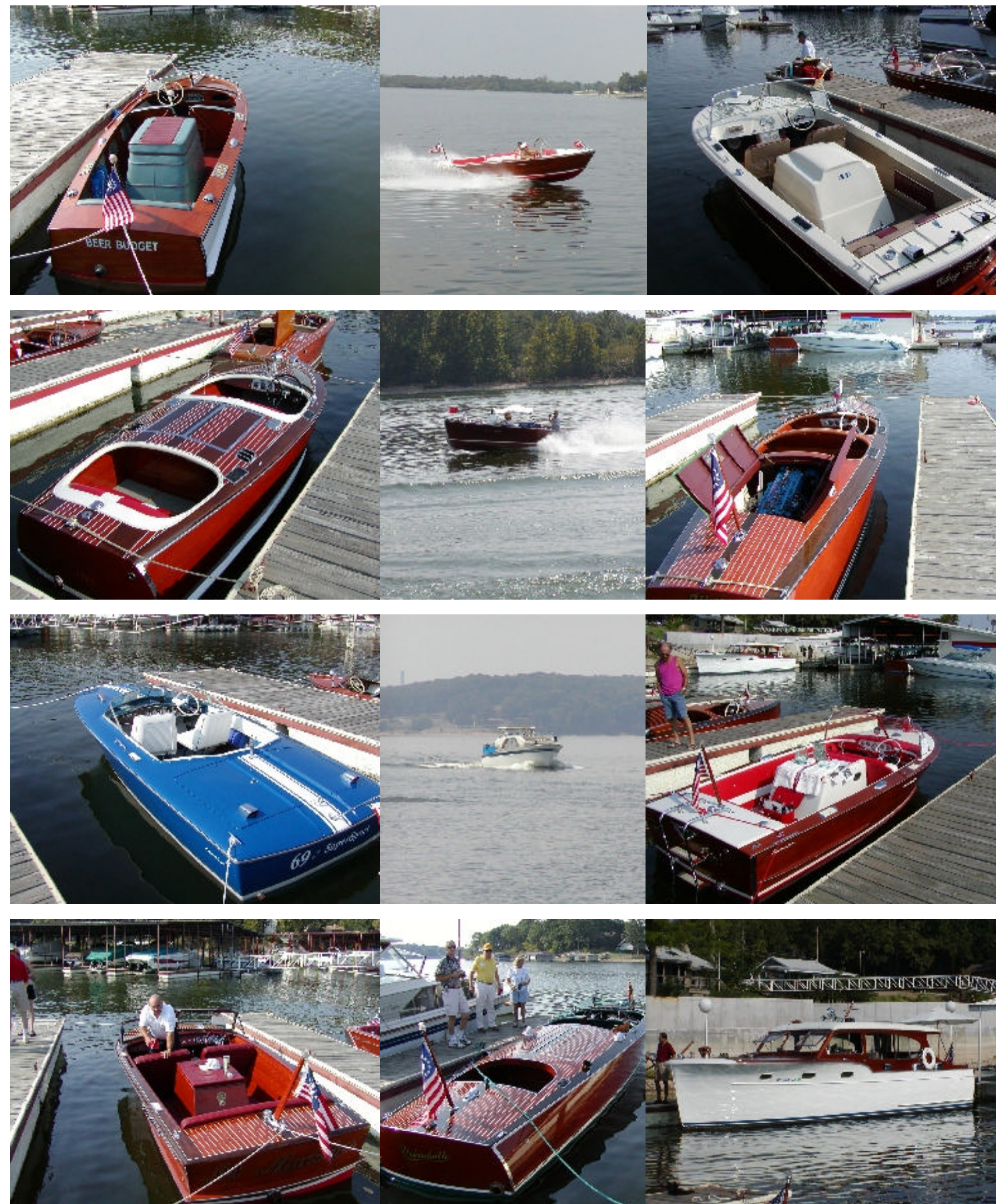
Photo Memories 9th Annual Boat Show