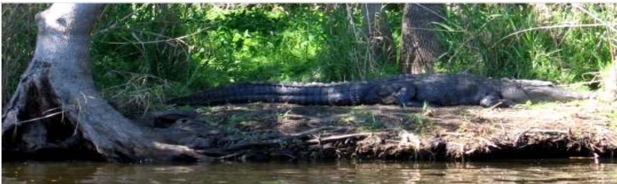
To the Left: Just an average day in Florida! Alligator lounging St. John's River 2009 Northbound cruise.